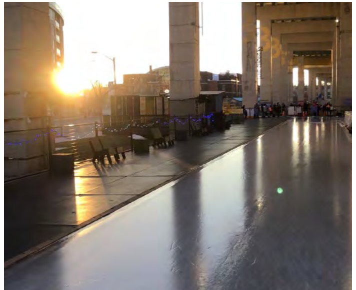
The Bentway Conservancy's skate way in the winter