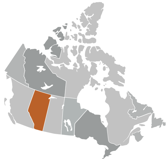
STRATHCONA COUNTY, ALBERTA